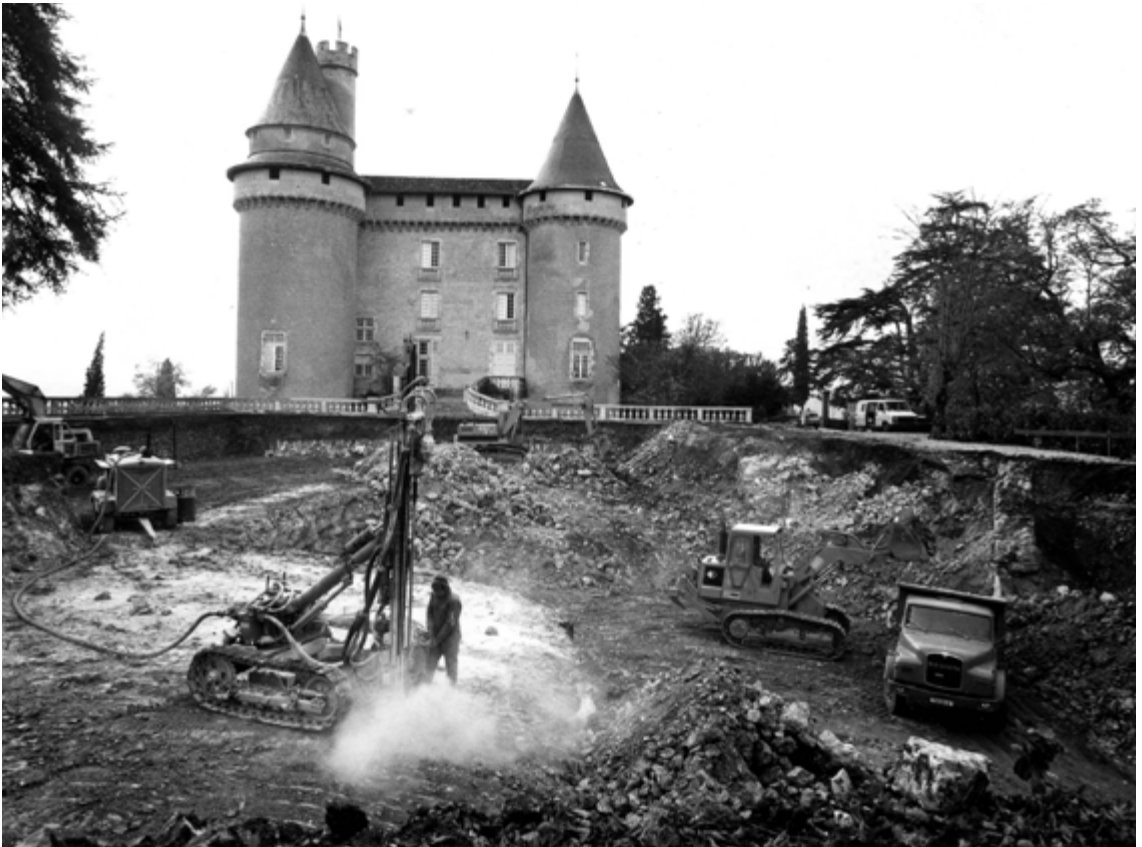
Winter 1986-1987: digging the soil of Château de Mercuès winery under the chateau's garden