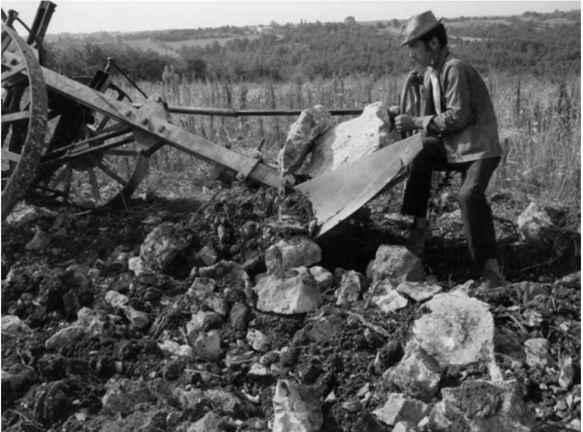
Crushing stones at Château de Haute-Serre when re-planting

The Cahors vineyard is considered as one of the oldest in Europe, and could be at least 2000 years old. Much appreciated from the beginning, it rose during the 12th century with the English, boosted by the marriage of Eleanor of Aquitaine to Henry Plantagenet.