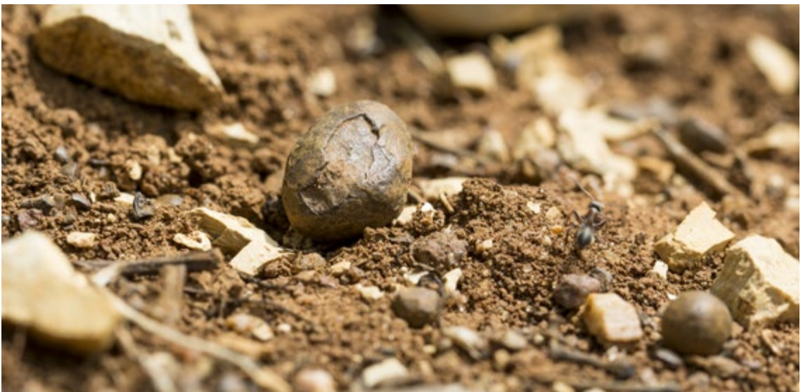
Ferruginous concretions on the red clay of the Château de Haute-Serre