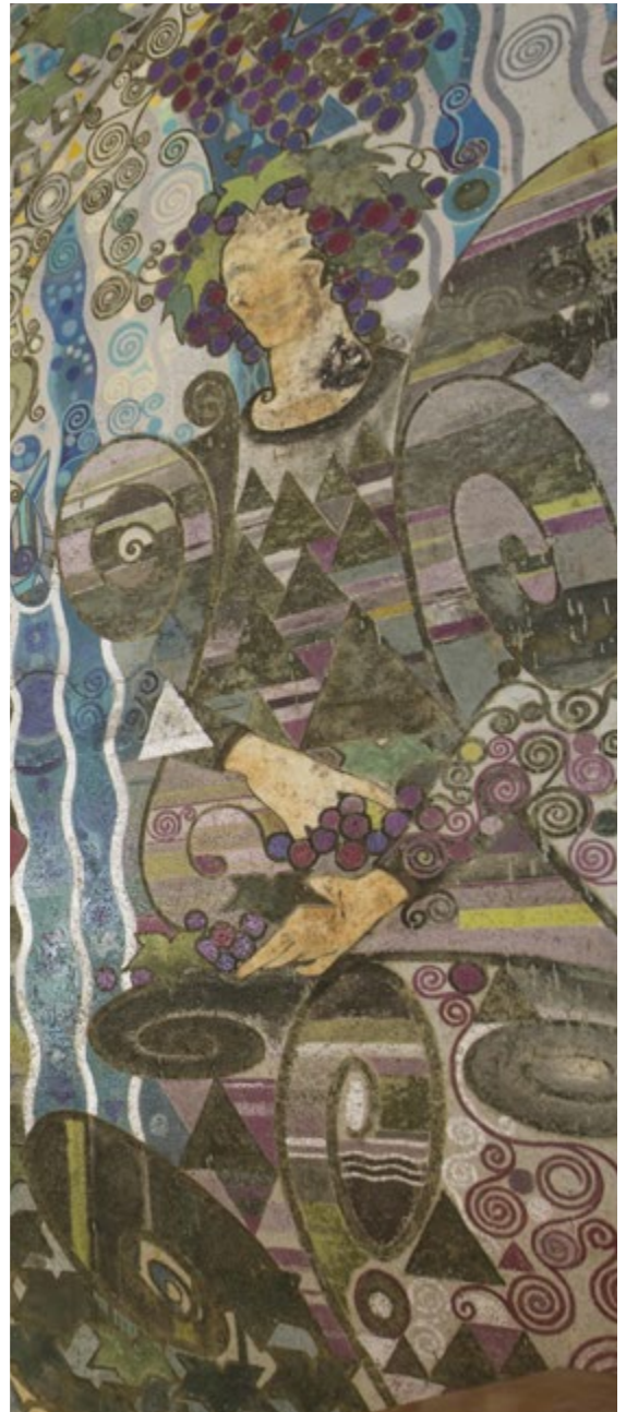
Fresco painted by Christine de Beauchêne in 1992