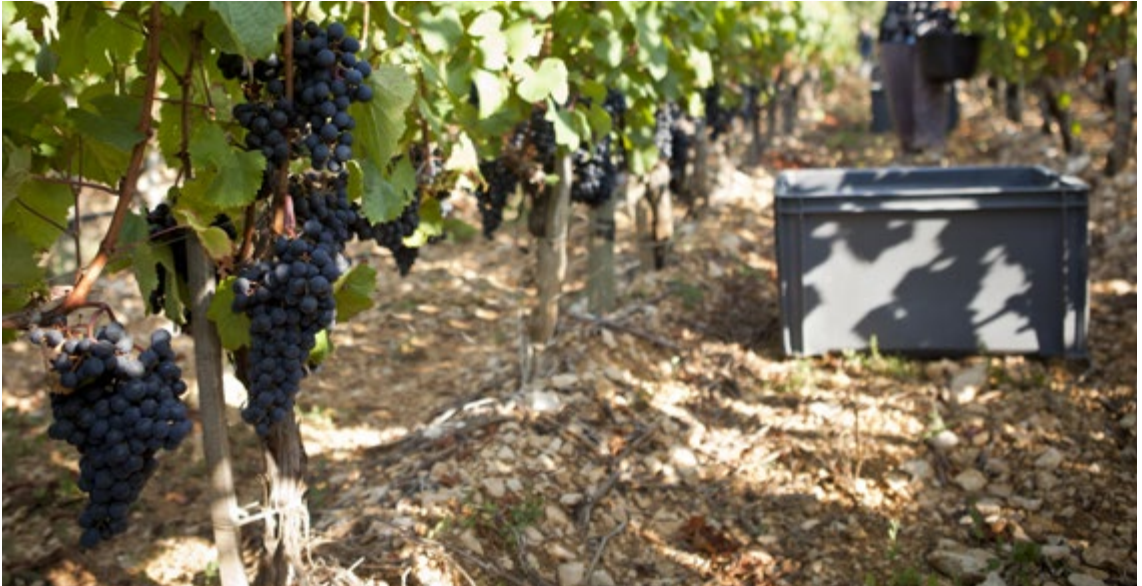
Clay and limestone from the Siderolitic