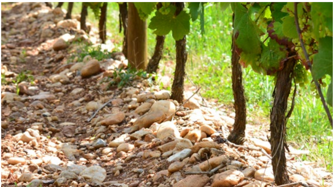
Silicious clay from the former quaternary period of the Château de Mercuès