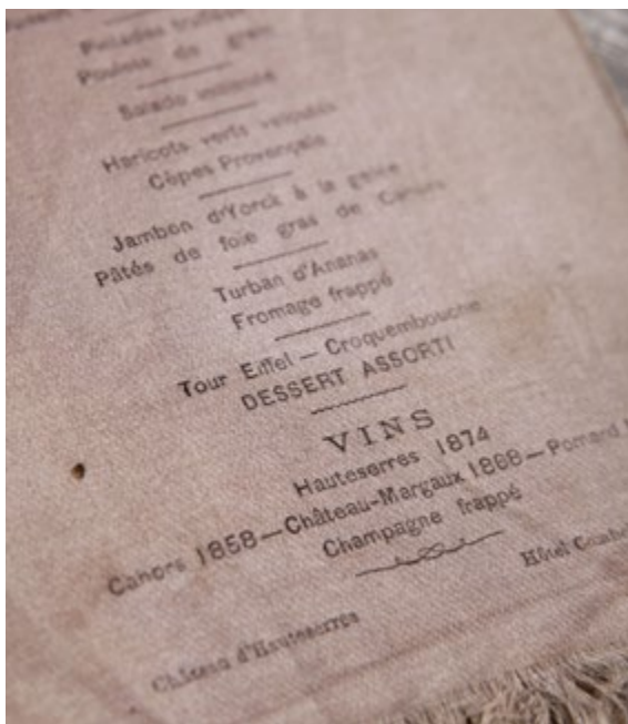
Gala menu in 1889